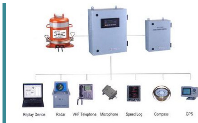
S-VDR typical equipment interface