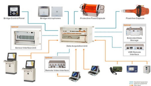
VDR typical equipment interface

Typical equipment interfaces with VDR and S-VDR are shown here.