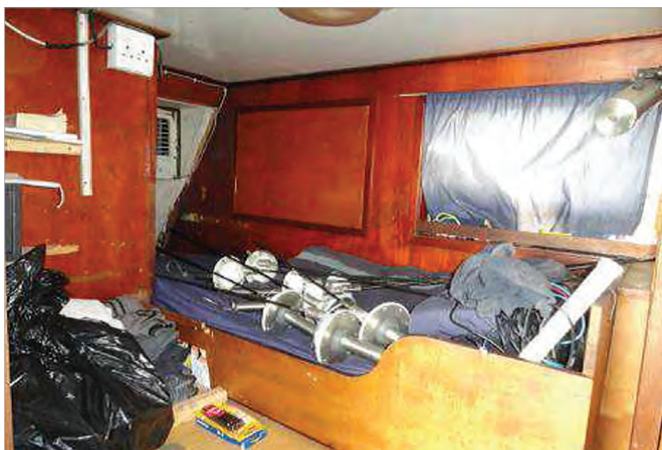
Answers: 1. Electrical socket wiring insulation poorly repaired with electrical tape 2. Using cabin to store equipment and parts 3. Storage of combustibles 4. Obstructed movement within cabin 5. A prize for any others you can find email - loss.prevention@nepia.com