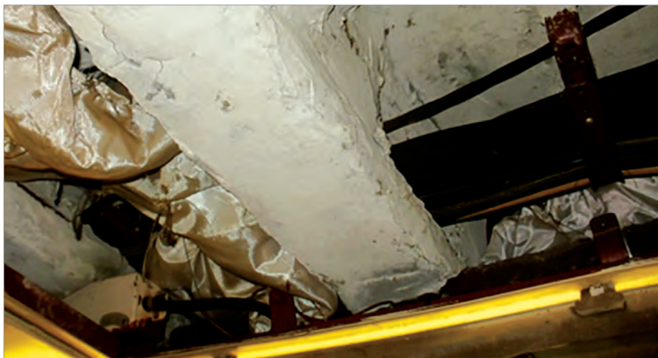
Asbestos on Ships.

Vigilance is key in preventing asbestos getting on board – it is always cheaper to exercise vigilance at the newbuild stage than to find yourself in the position of having asbestos discovered aboard during operations, having to screen the vessel for asbestos and remove any asbestos found in accordance with Flag State and Classification Society requirements.