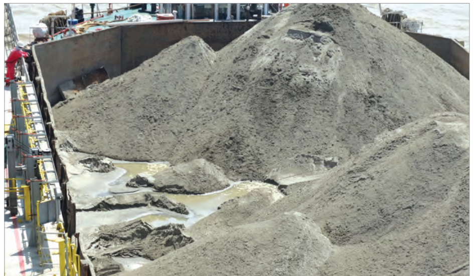
Transhipment of sand via a barge.

The most obvious potential BCSN, and the one most often used in this trade is "SAND". SAND is listed in the IMSBC code as a Group C cargo and is described as being usually fine particles, abrasive and dusty. The schedule describes the dusty nature of the cargo, keeping the cargo as dry as practicable before loading, after loading and during the voyage.