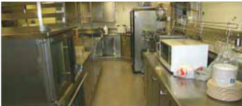
Clean food preparation area.

With regard to food temperatures, crew must be aware that there is a "danger zone". Hot food must be kept above 63°C and cold food must be maintained below 5°C.