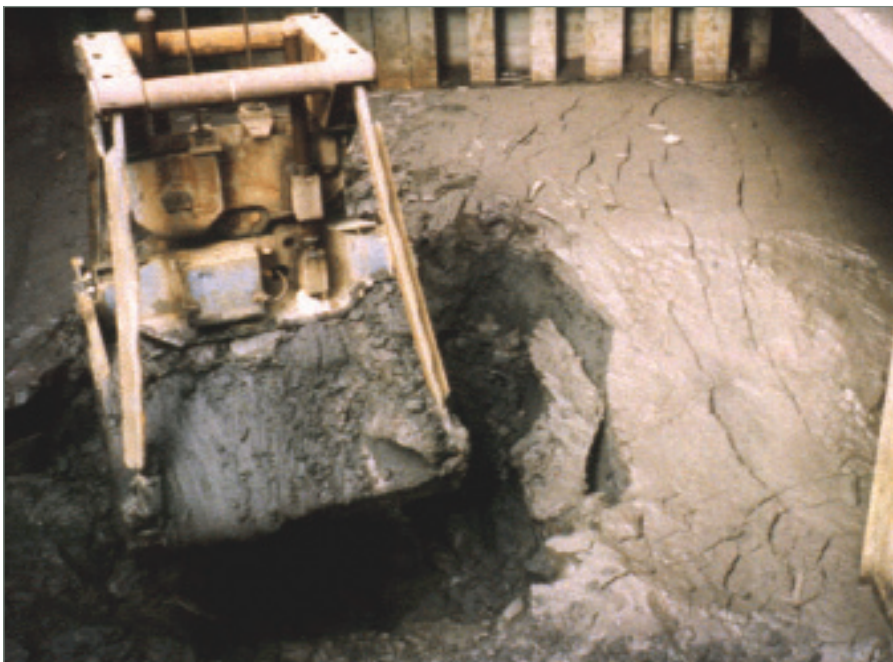
Ore cargo after liquefaction

Have you ever turned a bottle of ketchup upside down only to find nothing comes out, put the lid on, shaken the bottle and then swamped your plate with sauce? If so, you have experienced liquefaction.