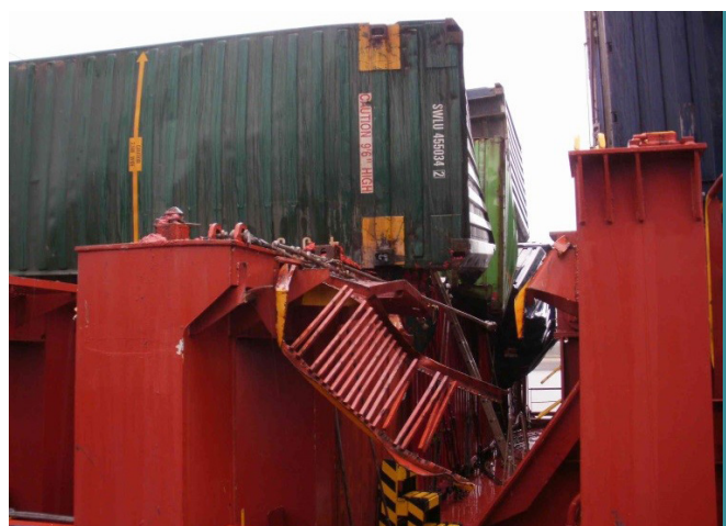
Take care not to pre-judge

Entering the investigation with an open mind is essential. Be objective and do not just accept the crew's or any other parties' versions of events at face value. An honest and realistic analysis can only be carried out with objective and unbiased information.