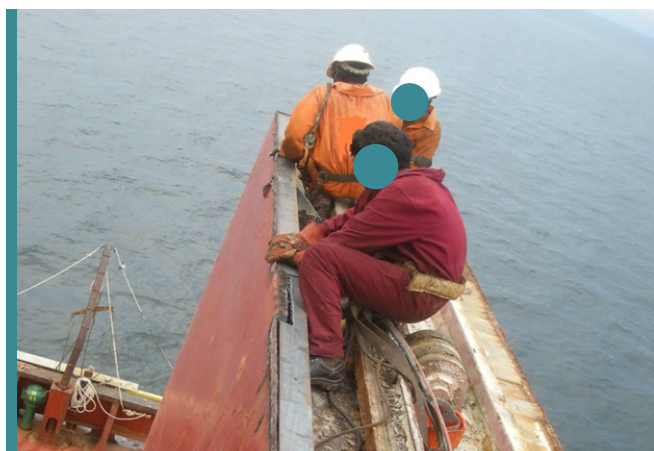
Unsafe working: But why?

People break the rules or take short cuts for a number of reasons. These reasons can range from the ignorant to the well intentioned to the reckless. The problem can only be addressed if the reasons for the violation are understood.