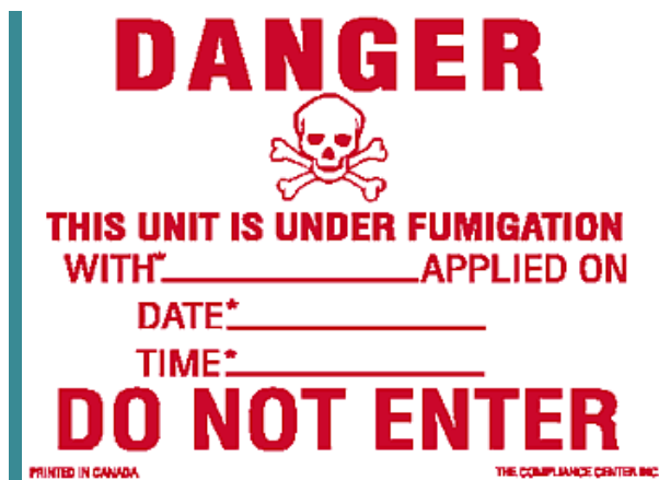
IMO Fumigation warning sign

Fumigation is the introduction of poison into a space to suffocate any insects or pests within.