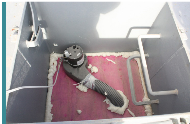
Recirculation fan positioned in hold access trunking

In order to ensure that the fumigant permeates the stow effectively, the fumigation company may install recirculation fans.