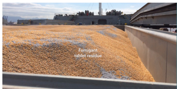
Fumigant pellet residues

Appendix 3 of the MSC Circular contains checklists covering the steps which must be taken by the fumigator in charge and the information which must be exchanged.