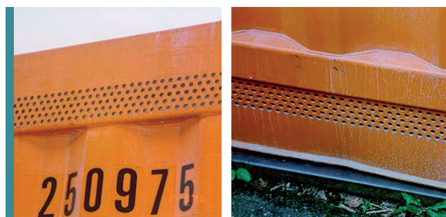
Figure 3: Ventilated container

Ventilated containers rely on air flow. When on board the carrying vessel, ventilated containers should be carried under-deck as the ventilation is at its most effective when subject to the forced air flow in the ship's holds. If stowed on deck, ventilated containers need to be protected from the elements that would normally be experienced at sea.