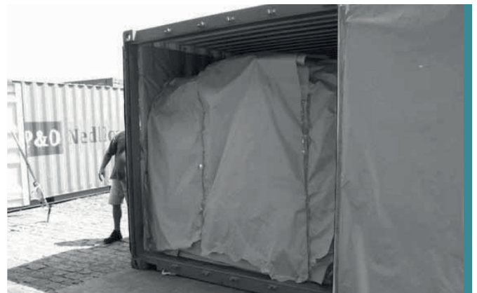
Figure 2: Lining paper applied to bagged cargo

But as the generation of condensation within an unventilated container is both an inevitable and a potentially continual process, any absorption capabilities of the lining material may be exceeded and wetting damage may be unavoidable.