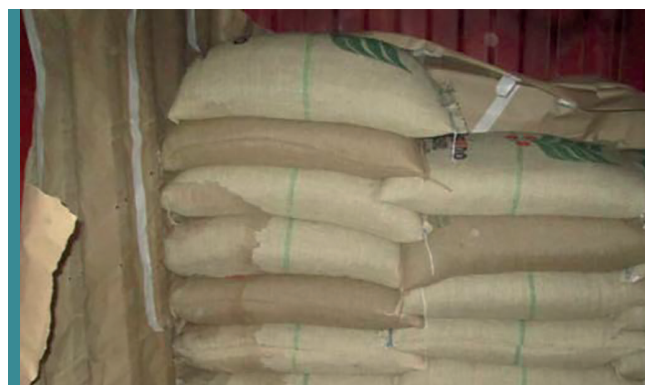
Figure 1: Water stained bagged cargo in a container

This briefing provides loss prevention advice to aid carriers in fulfilling their obligations when carrying bagged coffee cargoes in containers, particularly if considering offering a cargo consolidation service for shippers (i.e. LCL/FCL terms).