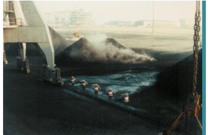
Figure 7: Steam rising from heating coal

Shippers must declare whether or not the coal they are exporting is liable to self-heat. Ship owners and masters should be aware that some shippers do not declare their cargoes as liable to self-heating or to produce methane even where there have been previous incidents involving these problems from the same source.