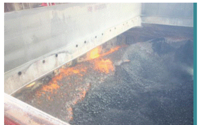
Figure 8: Coal on fire in a ship's hold

Firefighting, life-saving and smoke detection equipment must be well maintained and tested at all times.