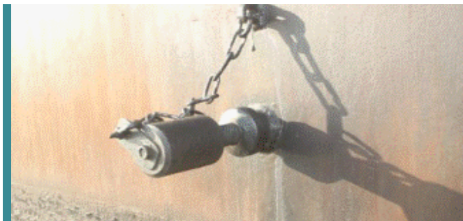
Figure 2: Sampling point in hatch coaming

The gas detector should be maintained and operated in accordance with the manufacturer's instructions which will include regular calibration.