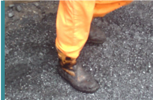
Figure 5: Dry crust of coal cargo

Inspection is important as a coal cargo may appear to be dry as seen in Figures 5 and 6.