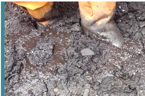
Figure 6: Damp coal underneath a dry crust

An initial inspection might suggest this cargo is dry. But a closer inspection could prove that only the surface of the coal is dry. There are clear signs of moisture underneath this crust. It is very possible that the moisture content of this cargo is above its TML.