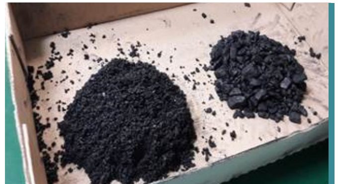
Figure 4: Coal sample after separation approximately 60% fine particles and 40% lumps.

Once the sample has been separated the approximate proportion of fine particles and lumps can be estimated as shown in Figure 4.