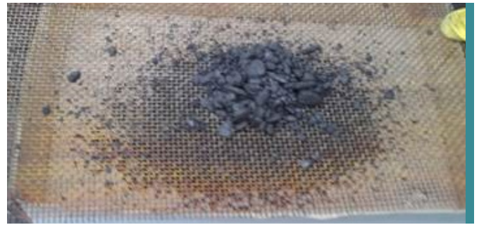
Figure 3: Separating fine particles and lumps of coal

A simple method of testing the cargo for the presence of fine particles is to use a sieve constructed of 7mm x 7mm wire mesh to separate a sample of the cargo.