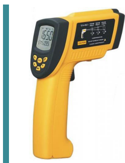
Figure 9: Smart AR882A IR Device for measuring temperature of the coal surface before loading or in the hold