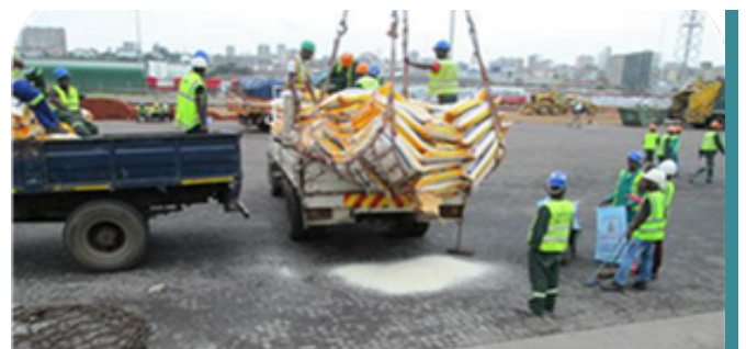
Cargo spillage due to poor handling

Therefore, it is important for tally clerks and ship's crew to remain vigilant and keep accurate records. If any suspect behaviour is noted, photographs or videos should be taken and times recorded, the Master should also note protest.