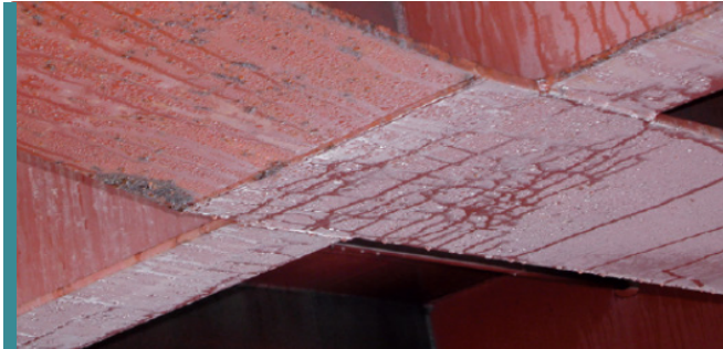
An example of ship's sweat

down due to the ambient temperatures. When it cools below the dew point of the air trapped in the hold, sweat will form on the vessel's exposed steel. This moisture then drips down, wetting the cargo and encouraging mould growth.