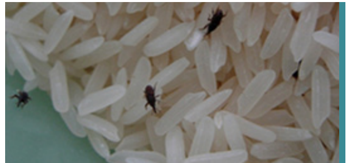
A cargo of rice with insect infestation.

Masters should check the type of fumigant that is to be used. The use of fumigants such as Methyl Bromide should not be accepted for a vessel whilst on passage. Methyl bromide is a toxic substance. Because it dissipates rapidly to the atmosphere, it is most dangerous at the fumigation site. Its use is now being phased out under the Montreal Protocol, however some parts of Asia still use it.