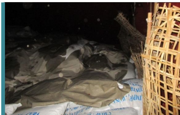
Wet Kraft paper and bamboo dunnage