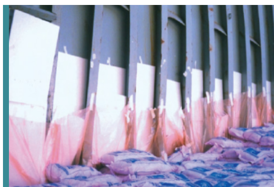
The polystyrene and plastic sheeting technique has proven unreliable.

If the application of the materials around the hold is inconsistent, the holds' framework remains exposed, as shown below and therefore the cargo sits in contact with the ship's steel in these areas.