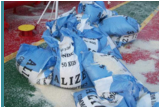
Damaged cargo should be rejected at the load port.

Should the Master require assistance at either the load or discharge port, he should contact the P&I club's local correspondent.