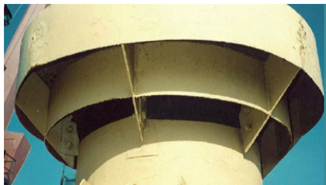
A vessel's mushroom vent

heavier. If they are left in any doubt, it could be wiser to suspend ventilation on the basis that if they do not and the cargo is damaged by rain water ingress, it may be difficult to defend in the event of a claim. If however the Master suspends ventilation for the rain, and properly records this in the ventilation log, they may be able to show they have acted in a prudent manner.