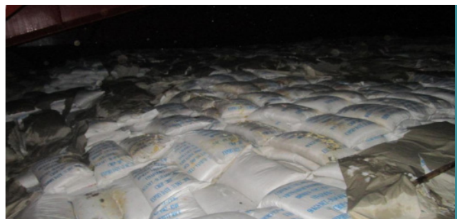
Bagged rice cargo covered in damp Kraft paper.

Excessive moisture and the metabolic processes within some agricultural cargoes can lead to oxygen depletion in the hold. This can make cargo holds and adjacent spaces hazardous. As such, the ship's SMS procedures regarding enclosed space entry should be followed when entering ships holds containing such cargo.