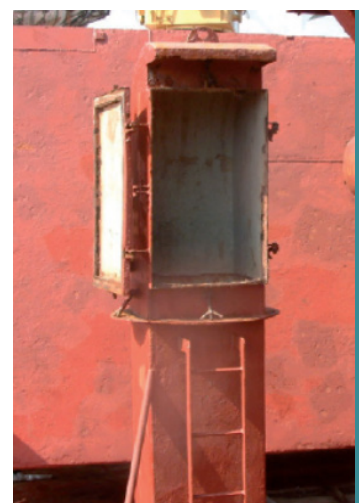
Some ventilation heads can expose the hold to ship's spray depending on their design, position and height on the vessel's deck.

A Master must be familiar with the vessel's ventilation arrangement and assess the risk of water ingress. If they believe there is a risk of water ingress, then ventilation should be stopped and accurate records made of this action.