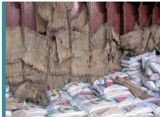
Bamboo and bamboo matting used for dunnage can be too thin and unsuitable

separated from the vessels sides and tank top to allow moisture run off throughout the intended voyage.