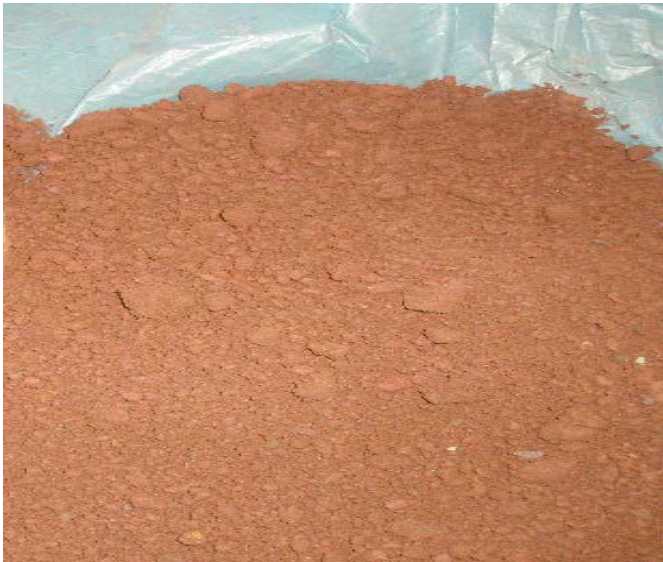
Iron Ore Fines

Incidents in which the Association has been involved have highlighted various operational problems that can arise when loading an iron ore fines cargo. Liquefaction, the typical problems it brings, and actions that may be taken to avoid the problems arising, are discussed below.