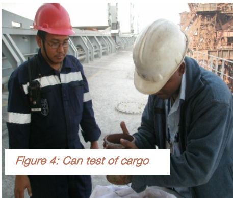
Figure 4: Can test of cargo

The appearance of the material at the end of the test can be used to form an opinion regarding the suitability of the material for shipment. This test should not be a substitute for proper laboratory testing using an