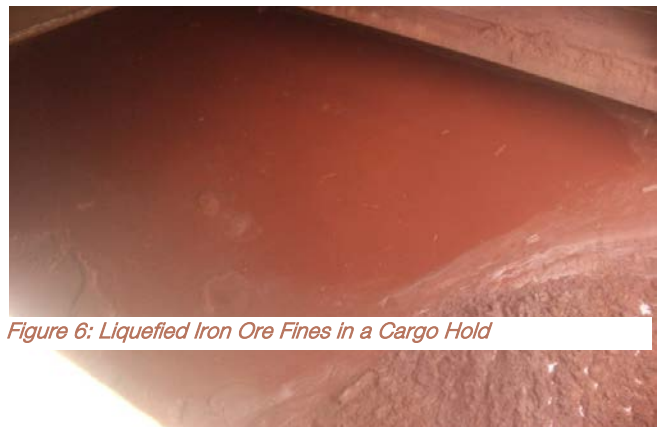
Figure 6: Liquefied Iron Ore Fines in a Cargo Hold

Suspect cargo should be sampled by an independent laboratory and, if found to be beyond its TML, then the safest option is to discharge the cargo. This sounds simple but unfortunately experience has shown that once a vessel has loaded wet iron ore fines it can be highly problematic for the vessel. A loaded cargo is regarded as being exported by the customs and excise authority, and this immediately creates bureaucratic difficulties for unloading. When combined with commercial reluctance on the part of the shippers and ports to accept/unload the unsuitable cargo the delays and costs that a vessel can experience may be considerable and can, in the worst cases, last for months. There may also be damage to valuable commercial relationships should such a dispute arise. It is always best for the vessel's safety and in the owner's interest that iron ore fines unsuitable for shipment are identified before they come onboard.