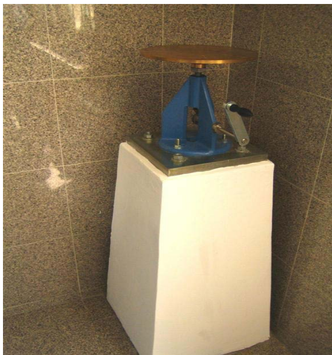
Figure 3: A Flow Table

Shippers are also required, as per Section 4.3.3, to establish procedures for 'sampling, testing and controlling moisture content to ensure the moisture content is less than TML'. These procedures should be approved and