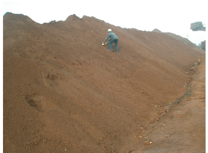
Figure 1: Cargo at shipper's stack-yard

The main reference for any ship operator or master when considering whether or not a cargo is likely to liquefy is to refer to the International Maritime Solid Bulk Cargoes (IMSBC) Code. The dangers associated with commonly shipped cargoes are listed within the Code – Group A cargoes are those that are likely to liquefy. Any cargo listed as Group A should be carried strictly in accordance with the provisions of the IMSBC Code.