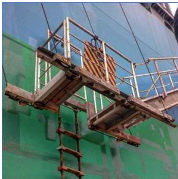
Fig 1: Non-compliant Arrangement

The relevant documents are SOLAS V Regulation 23, IMO Resolution A. 1045 (27) and guidance from Embarkation & Disembarkation of Pilots Code of Safe Practice.