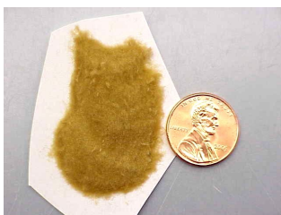
Gypsy Moth egg mass next to penny