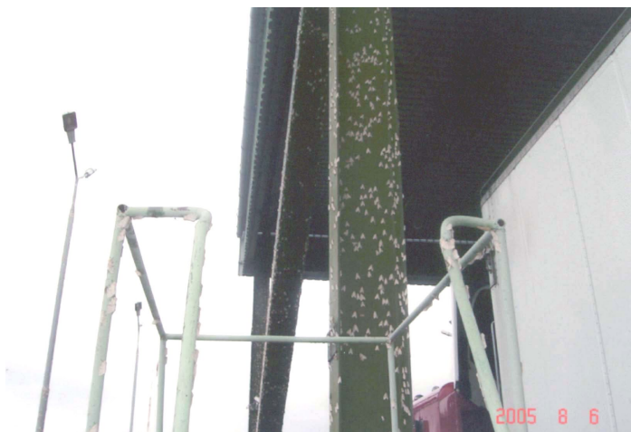
A vessel covered with egg-laying Gypsy Moths in a Russian Port

Knife, paint scraper, or putty knife - to scrape the eggs from the structure.