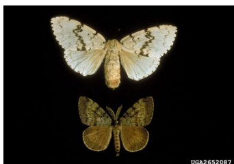
Adult Female (top) and Male (bottom)